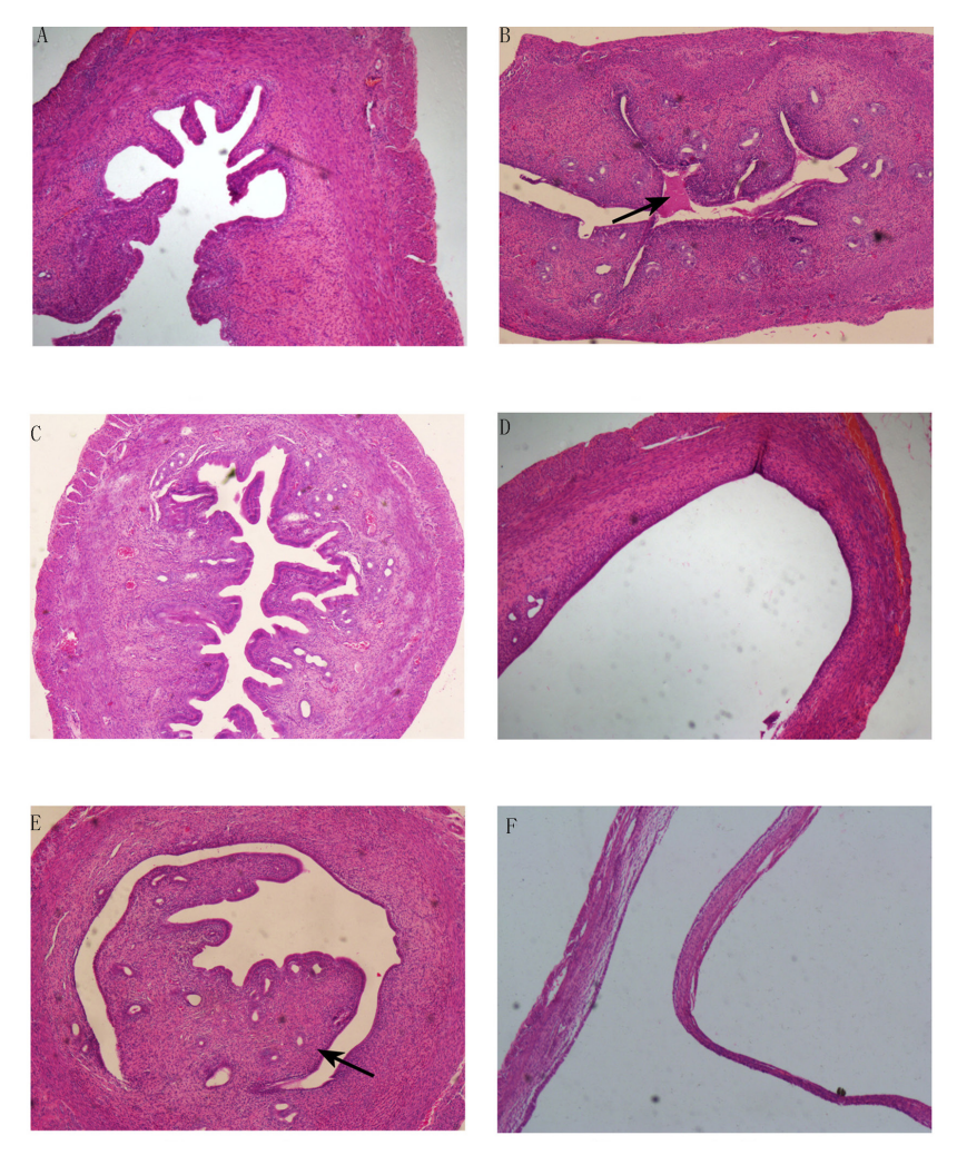
Figure 1. A. Control group: At junction oviduct rich in folds mucosal layer: muscular layer 1:1. B. Ex-treated acute group: Submucosal edema, tube cavity necrosis exudation and epithelial shedding (black arrow). C. Treated acute group: mucosal folds recovered and the proportion of submucosa and muscularis was close to 1:1. D. Ex-treated chronic group: oviduct swelling and enlargement appeared, mucosa epithelium replaced by single squamous epithelium. E. Treated chronic group: lumen stenosis, polyps and incomplete obstruction (black arrow). F. Chronic model group: serious hydrosalpinx, tubal wall fibrosis (magnified 100X).

showed no statistical difference; P > 0.05). The ex-treated chronic group had massive granulation tissue, deep collagen staining deep and unclear boundaries. GL values were decreased and the differences were statistically significant compared with both the control group and the treated acute group (P < 0.05). After treatment, submucosal collagen was not reduced. A large number of corrugated, cord-like, dark gray, blue collagen fibers could be seen in the chronic model group (Figure 2A-F). GL values were the lowest in this group and the differences were statistically significant compared with the control group and treated chronic group (P < 0.05). The results are shown in Table 1.