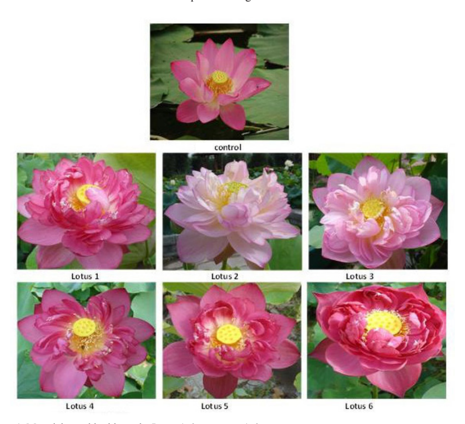
Figure 1. Materials used in this study. Lotus 1-6 = mutants 1-6.