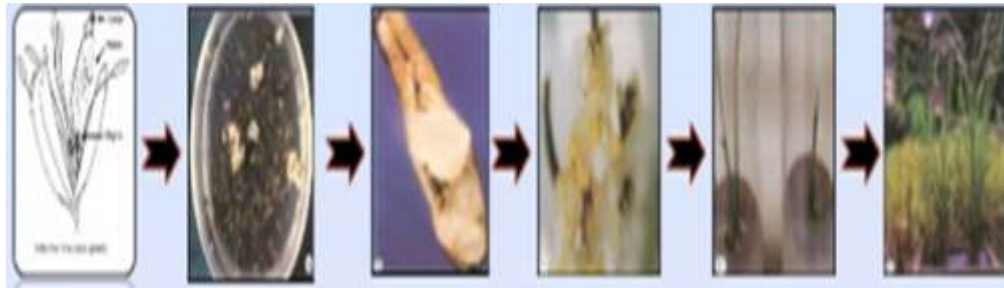
Figure 3: Quantity of seeds delivered by a solitary plant.

Operating capital: All breeding programmes are operated within the limits of available operating capital. Therefore, reducing the overall cost is always an important consideration when choosing a strategy. In addition to the use of the most economic mating and testing approaches, other factors affecting the cost also need to be considered. In the context of gene pyramiding, cost affects both what can be achieved and how to achieve. Increasing the numbers of generations (duration) will it. Increasing the number of generations (duration) will reduce the pressure on population size required in each generation and may result in the reduction of the total cost. However, increasing the duration delays the release of the new cultivar and consequently reduced market share.