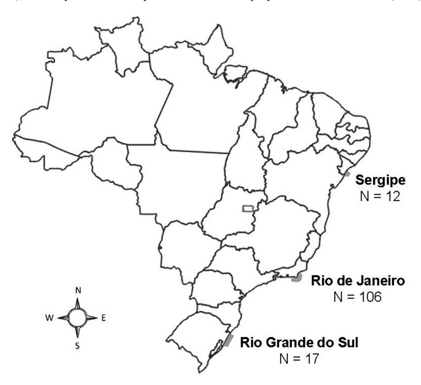
Figure 1. Collection sites and number (N) of stranded Magellanic penguin ( Spheniscus magellanicus ) samples gathered along the Brazilian coast in 2008.

Total genomic DNA extraction was carried out according to a modified protocol from Damato and Corach (1996), using a lysis buffer containing 2% cetyl trimethyl ammonium bromide (CTAB), 100 mM Tris-HCl pH 8.0, 20 mM EDTA and 1.4 M NaCl. CHD-Z and CHD-W introns were amplified by PCR using P2 (5'-TCT GCA TCG CTA AAT CCT TT-3') and P8 (5'-CTC CCA AGG ATG AGR AAY TG-3') primers (Griffiths et al., 1998). Each 10-µL reaction mixture contained about 10 ng genomic DNA, 1 µM of each primer and 0.25 U Taq DNA polymerase (Biotools), also including 2 mM MgCl, and 200 µM dNTPs. The PCR amplifica-