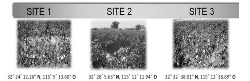
Figure 1. Images of the sites of collection of rhizosphere soil samples from a transgenic insect-resistant cotton crop in the Mexicali valley.

were made and 0.1 ml aliquots (10<sup>3</sup>-10<sup>5</sup>) were spread on plates containing potato dextrose agar (PDA). The PDA plates were incubated for 7 days at 30°C and morphologically different colonies that appeared on the medium were isolated and sub-cultured for further analysis.