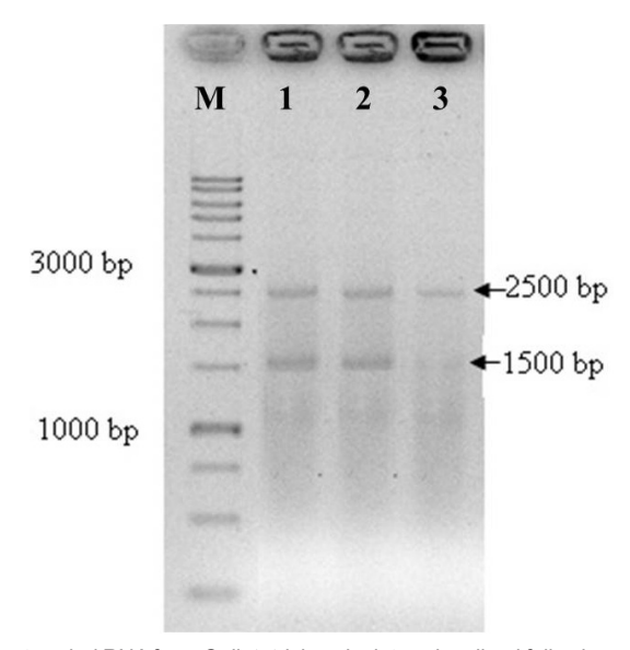
Figure 1. Bands of double-stranded RNA from Colletotrichum isolates visualized following agarose gel electrophoresis. Lane M = 1-kb DNA ladder; lane 1 = dsRNA extracted from phytopathogenic isolate CNPUV 378; lanes 2 and 3 = treatment of the dsRNA from lane 1 with the DNAse RQ1 and nuclease S1 enzymes, respectively.

and without genetic material, in CNPUV 378, which was in agreement with the data obtained by molecular analysis.