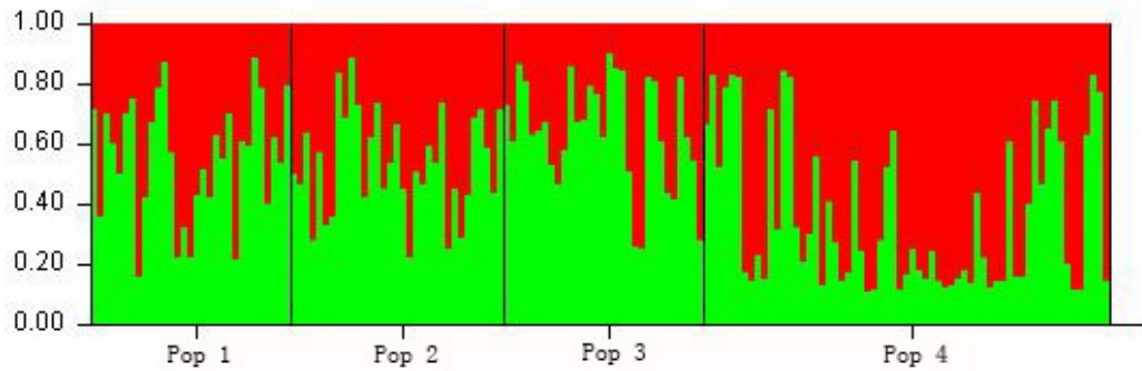
Figure 3. Population structure of four populations of Pinus dabeshanensis estimated by STRUCTURE at K = 2. Thin vertical lines represent individuals.