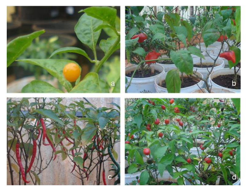
Figure 1. Plants of Capsicum chinense (a. BAGC 23), C. baccatum var. pendulum (b. BAGC 26), C. annuum var. annuum (c. BAGC 40), and C. annuum var. glabriusculum (d. BAGC 36) used for electrophoresis analysis.

PI = Piauí; PE = Pernambuco; MA = Maranhão.