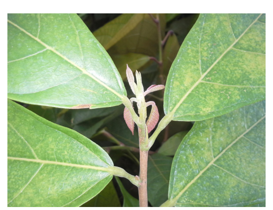
Figure 1. Active and healthy shoot apical meristem of Theobroma cacao .

The shoot apical meristems used in this study were collected from approximately 6-year-old cacao "Colección Castro Naranjal" (CCN) 51 trees growing at the Mars Center for Cocoa Science, Barro Preto, Bahia, Brazil (14°42'45.021171"S and 39°22'13.008369"W). Healthy and active meristems, about 6 mm in size, were selected for use in the experiments (Figure 1).