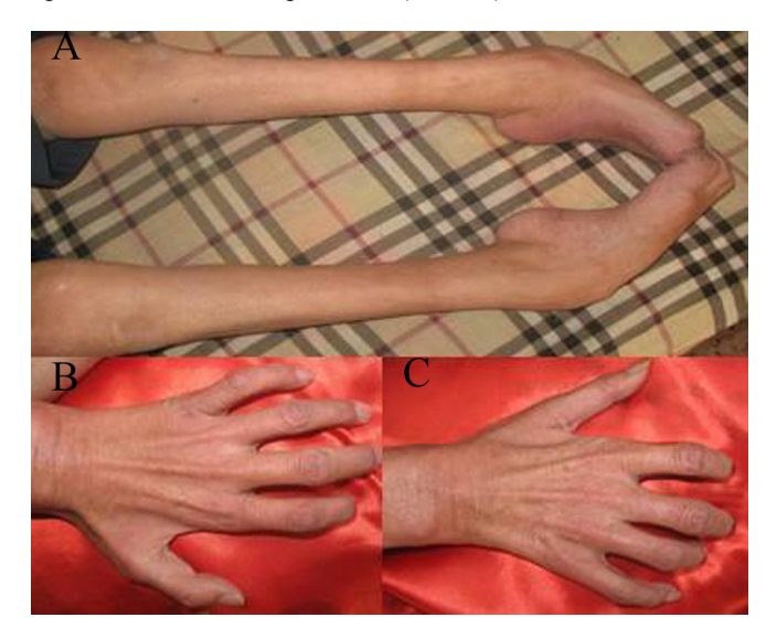
Figure 1. The phenotype of the proband. The proband had hollow foot (A), claw hand deformity and severe muscle atrophy of lower and upper distal extremities (B, C).

The proband was a 65-year-old men who had hollow foot, claw hand deformity, and severe muscle atrophy of the lower and upper distal extremities. Deep tendon reflexes of lower distal extremities were absent and sensory disturbances were mild. He was the worst one in this family and currently wheelchair-bound (Figure 1). His age onset was about 8 years. Neurophysiological data showed that motor nerve conduction velocity (MCV) was 37.4 m/s, the sense nerve conduction velocity (NCV) was slightly reduced, the compound nerve action potential (CNAP) of the right common peroneal was also reduced, and the CNAP of the left common peroneal and the compound motor action potential (CMAP) of the bilateralis could not be elicited.